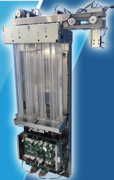
Ticket Collection Module GCM02